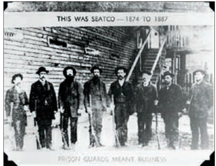
Guards at the SEATCO Territorial Prison.

From 1874 – 1888 Bucoda was home to the Territorial Prison, a contract prison, until Washington achieved statehood and opened the state penitentiary in Walla Walla. The building was two storied, with entry via an external staircase to the second floor and guard gallery. The cells on the lower floor. By all accounts it was not a pleasant place to be incarcerated. Prisoners were not issued uniforms and had to wear