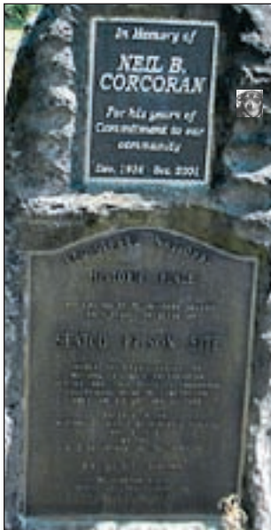
A stone with two plaques marks the spot of the prison.

Now for a bit of history; you see I'm still not so desperate for content I must resort to satire. . . but give it time.