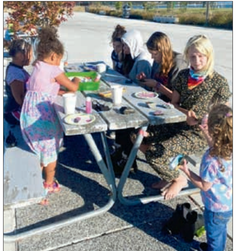
Members of Acorn Theta Rho Girls' Club in Oak Harbor enjoyed the sun as they were busy painting rocks.