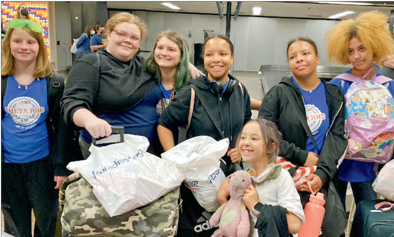
Washington's Theta Rho Girls were happy to be home but exhausted as they gathered their luggage at SeaTac Airport in Seattle after their flight from Winston-Salem,